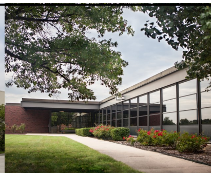
CITY CENTER 301 S. Grove Wichita, KS 67218 (Appointment only)