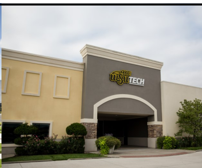
WSU SOUTH 3821 E. Harry Wichita, KS 67218