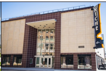
NICHE 124 S Broadway Wichita, KS 67202