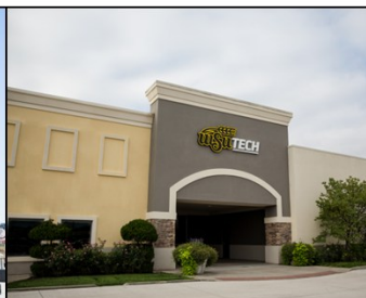
WSU SOUTH 3821 E. Harry Wichita, KS 67218